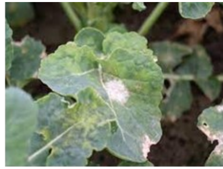
Light Leaf Spot

Cereals Late drilling after beet and maize is still very possible. Keep the seed rate up over 450 sees/m 2 to ensure good establishment and population. Weed control is still possible and should definitely be considered where Blackgrass or resistant grass weeds are present.